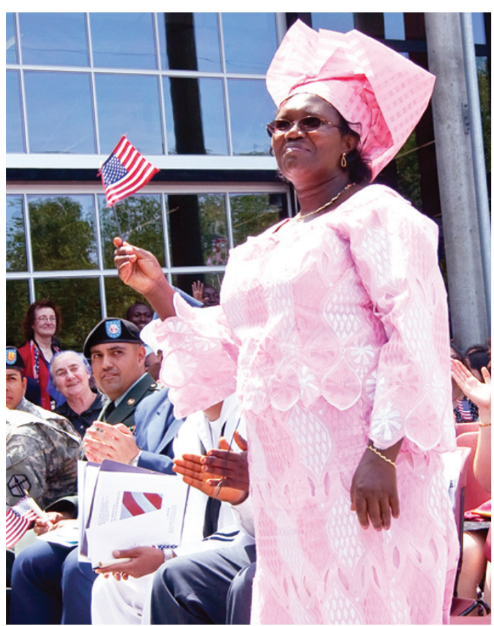
Naturalization Ceremony for U.S. Citizens