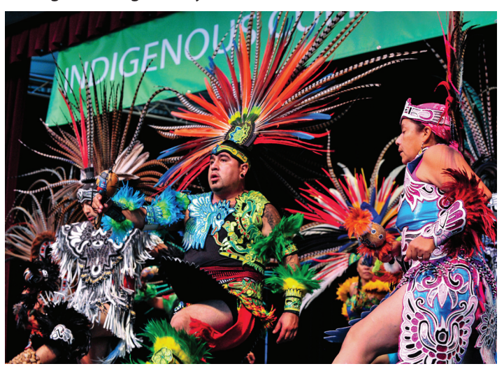
Festál: Spirit of Indigenous People

Seattle Center also partners with dozens of community-based cultural groups to produce programs like Festál. Through events drawing on the world's cultural traditions, these programs support and enhance cultural stewardship, innovation, and creativity in diverse neighborhoods throughout King County.