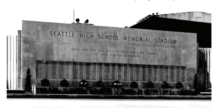
Memorial Stadium opened in 1947, Memorial Wall was dedicated in 1951

More than 50 years after its founding as a city department, Seattle Center is still the heart of the city. Through all these years it has remained agile – evolving and adapting as our community has grown and changed. Experiences at Seattle Center continue to touch us individually, knit us together as a community, and help us share our collective humanity. Like New York's Central Park or Millennium Park in Chicago, Seattle Center could become an iconic part of our city's identity.